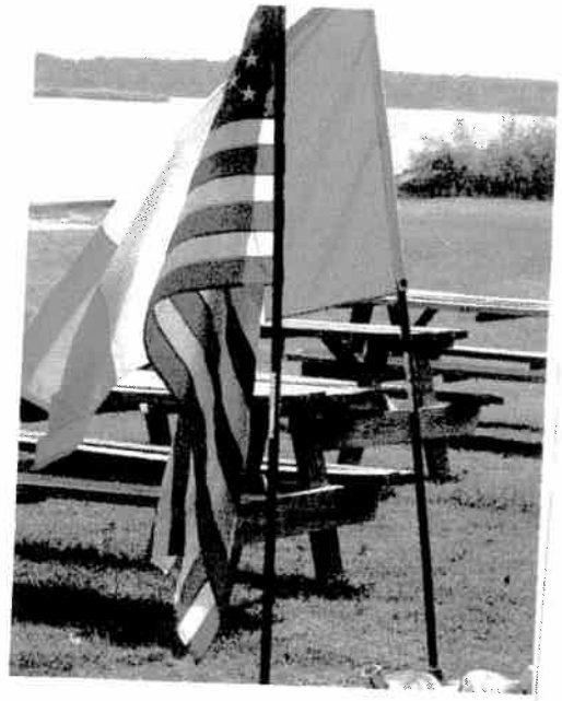
Flags on the beach at our Crab Fest.

Ad vise Tim if you want to work early or late, but plan to enjoy the music, dancing, fine food, beverages of all sorts, and have a chance to do Christmas shopping at prices better than in Ireland.