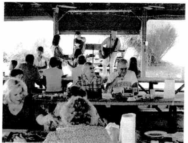
Freedom Sons Irish Music