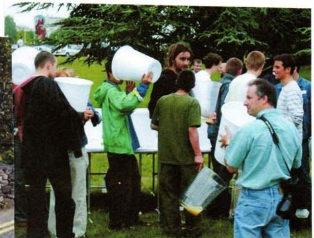
Getting around the one-drink rule.